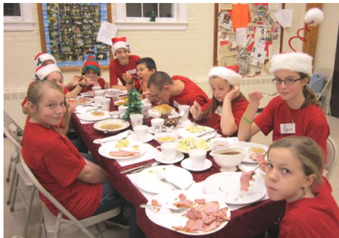
Some of our MSYG members enjoying a delicious meal after a wonderful job of serving at the Service Club's annual ham dinner.